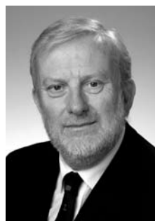
Andrew Miller MP Chairman, Parliamentary and Scientific Committee

Much attention is currently being devoted to investigating the need for and future development of Technology Innovation Centres as a way to ensure that the UK considers all the options before us. There is both an urgent need and new opportunity to help supply the Developing World with the products they require from us and to help manage their increasing demands for improved infrastructure and their burgeoning human populations. This is one important area where a new generation of Technology Innovation Centres based in the UK could really make a difference if we get the funding and structures right.