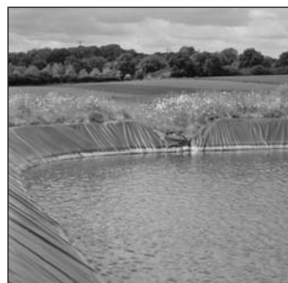
Farm storage - Mullens irrigation lagoon, Wiltshire

• Smaller scale water storage can also provide broad benefits, especially within the agricultural sector. Whilst generally constituting only a small proportion of total water use, on hot summer days