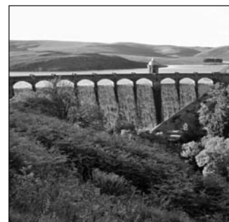
Large scale storage - Graig Goch reservoir, Mid-Wales